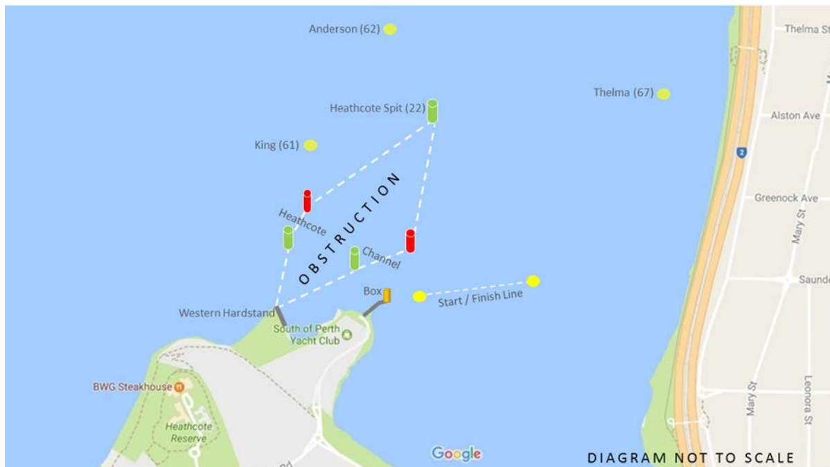
Western Hardstand to Heathcote Spit (22) Obstruction