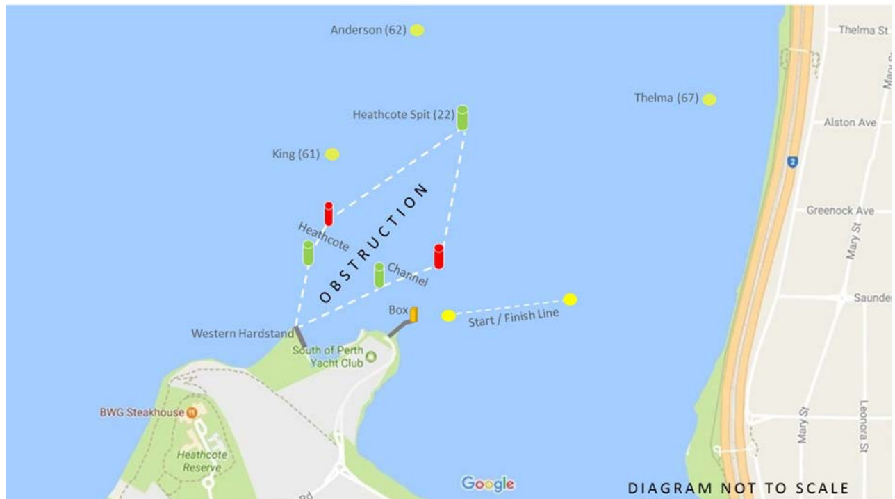
Western Hardstand to Heathcote Spit (22) Obstruction