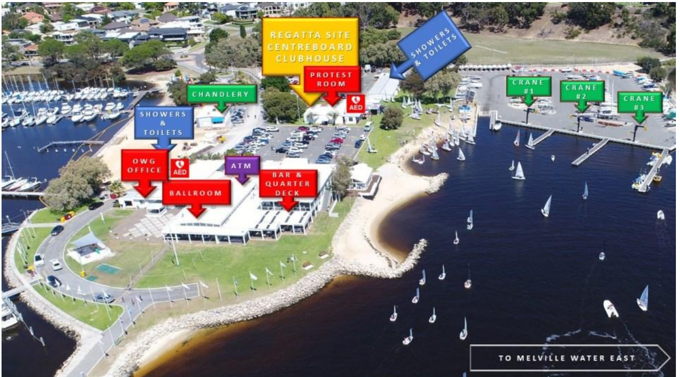
South of Perth Yacht Club overlooking Melville Water East (MWE) race area